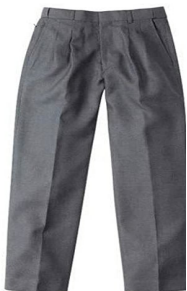
Dark Grey Pant Grade IX & X