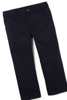
Blue Pant Grade X & X