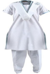
White House Uniform