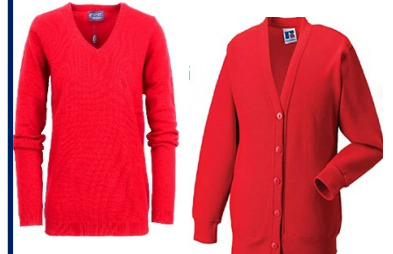
Red cardigan/ V-Neck