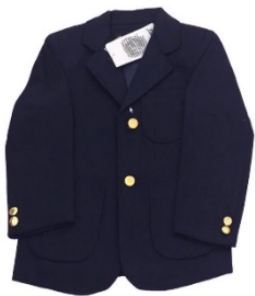
Navy Blue Coat/Blazer