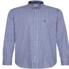
Blue Shirt Check