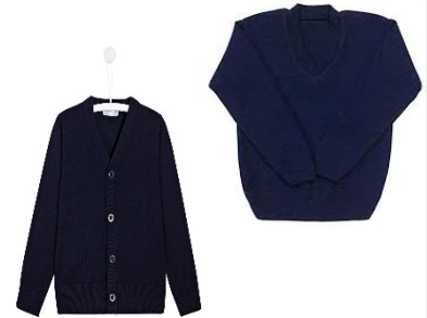
Blue Sweater V-neck or Cardigan