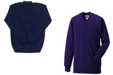
Navy Blue V-neck Sweater/ Cardigan