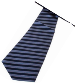
Striped tie Navy Blue and Light Blue