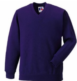
Navy Blue Sweater Grade IX & X